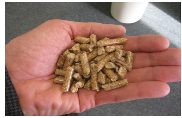
Randy is holding a handfull of wood pellets used for the biogasoline process.

The pilot plant process is extremely efficient and produces a very limited amount of emissions, mostly from the combustion of natural gas. SAI assisted Primus in the preparation of estimated emission calculations and the submission of NJDEP's RADIUS permit application. SAI organized pre-application meetings with representatives from the NJDEP Air