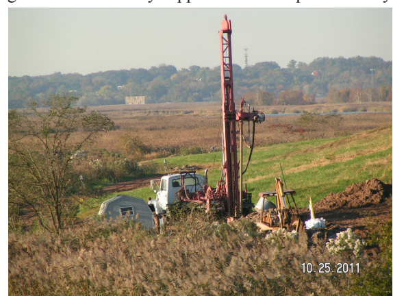
A view of an extraction well at ILR Landfill, with wetlands in the background. This area will be used to site some of the solar panels when the project is completed.

SAI has completed a site plan that was presented to the Edison Township Planning Board. The Board granted Preliminary Approval of the plan in May