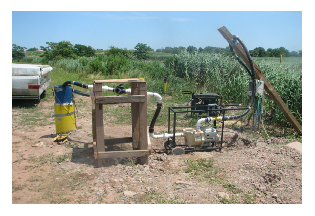
Above, a photo of SAI's variable speed high capacity pump.

SAI staff designed and constructed a variable speed high capacity pump for performing long-term constant rate aquifer pumping tests. Aquifer tests performed with high capacity pumps are invaluable for defining site-specific hydrogeology and estimating critical aquifer parameter values.