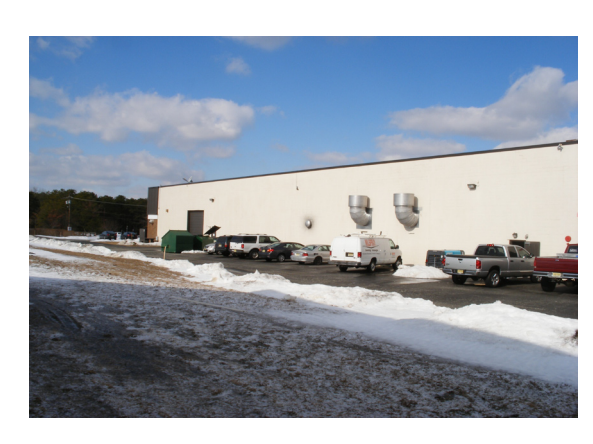
A view of the outside of the MedAssure facility in Lakewood, NJ.

light industrial building to accommodate the treatment system. The permit application also included a separate air permit for the vent system required for the treatment process. The treatment process selected by MedAssure is a Sanitec Microwave Disinfection Unit (MDU), which is capable of processing approximately 1,000-1,200 pounds per hour of RMW. The MDU includes a shredder to pulverize the incoming waste materials thoroughly, followed by a steam and microwave radiation disinfection process. At this point the treated waste is completely sterilized and no longer contains any recognizable components of RMW. It can therefore be classified as ordinary solid